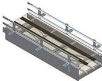
ArrowSelect Mat Top ISO