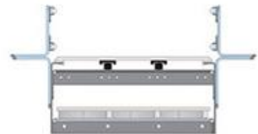
ArrowSelect Mat Top Cross Section