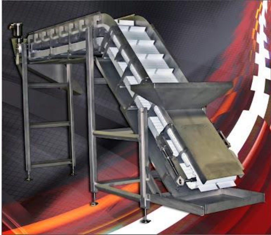
THE NEXTCONVEYOR INCLINE CONVEYOR WITH INFEED HOPPER AND DISCHARGE CHUTE

Arrowhead Conveyor's sanitary line of equipment NeXtconveyor, introduces a new and unique bulk hopper conveyor. Our latest design is this cleated incline conveyor with an infeed hopper and discharge chute. This system is capable of handling a wide variety of food or pharmaceutical products. Our NeXtgen hybrid design is suitable for USDA applications such as raw meats, poultry and seafood.